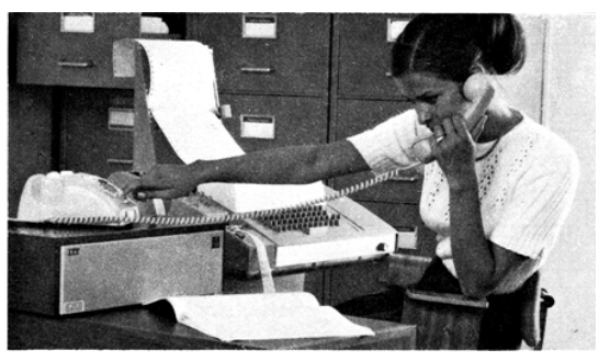
Fig.1. A costumer dialing DelData

ØK Data had established a sales and marketing organization well before the opening and operated the system, where a user logged in from his terminal by dialing the DelData access number and typing his personal access code. The user could write and run programs in Basic and Fortran (later also Algol), run pre-stored programs and store data. ØK Data offered year after year programming courses with Basic as the most popular language. But Fortran was often chosen for bigger computational jobs such as engineering problems and statistical applications.