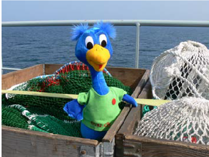
Fig. 3. The EMU toy animal participating in the Galathea3 expedition 2006-2007