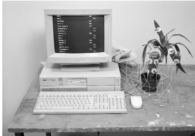
Fig. 4. Ola Pehrson, Yucca Invest Trading Plant , 1999.

archive on the Internet that contains deleted files from various computers connected to the Internet. The ADF expands by being used by its visitors, since the only way to get access to the archive is to agree to submit deleted files from your own computer. As you agree to do this, the program Trojan Horse 1.01 is automatically downloaded to your computer, and the program starts to scan the hard disk for deleted files, recovers them and finally sends them back to the archive. When this is done, the visitor gets access to the archive. In the project Wrange and Tollmar used the Internet to investigate questions raised around the Internet such as surveillance and democracy. ADF is an early example of what has been referred to as Internet art [21]. The ADF was part of an exhibition on the Internet organized by the organization [a:t] Association for Temporary Art, founded by Karin Hansson (b. 1967) and Åsa Andersson Broms (b. 1967). The exhibition was the first event organized by [a:t] and involved artists as well as companies and institutions working with ICT [8, 9], [22].