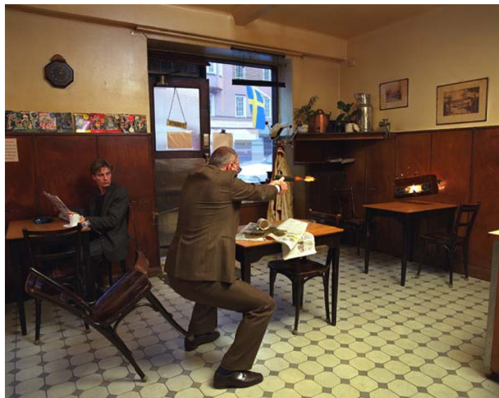
Fig. 1. Olof Glemme, På Kafé , 1993.

På Kafé from 1993 by Olof Glemme (b. 1952) is an early example of ICT used as a tool in the making of photography (fig. 1). The photograph depicts a man using a gun shooting at a radio in a café, and it is considered to be the first photograph Glemme has created by using digital image processing technology [5].