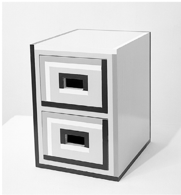
Fig. 6. Ola Pehrson, Winfile.exe , 1997. Courtesy of Ola Pehrson Foundation, Stockholm.

The sculpture, a piece of office furniture containing physical storage space, is a three-dimensional artifact of a graphical user interface [26]. The starting point for the sculpture has been the desktop icon that Pehrson has given the shape of a physical object. However, there is yet another dimension of importance to the interpretation of the sculpture, since the archetype for the original desktop icon was a piece of physical office furniture. By reshaping the desktop icon as a three dimensional object means that Pehrson has returned the desktop icon back to the material world [27]. The transfer of the object between the virtual and real world illustrated by Winfile.exe has similarities with the subject discussed in the case of Objects of Virtual Desire .