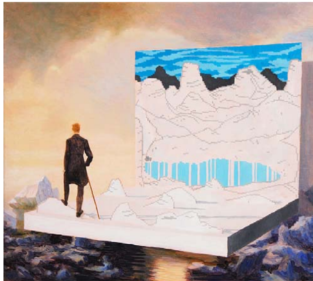
Fig. 2. Kristoffer Zetterstrand, Wanderer , 2008. Courtesy of Kristoffer Zetterstrand.

introduction Glemme stages an idea by using people, environments and details, which he photographs. På Kafé was photographed with an analogue camera. He then scanned the photograph, whereupon he arranged the final picture by using the image-processing program Photoshop. Nowadays, he uses a digital camera from the start, [4]. Paul's investigation puts to the fore a number of ways by which manipulation is made possible by using digital technology in photography. Whereas some could be almost invisible in the final picture, others leave more visible traces. We find examples of the former in På Kafé with the coat at the hook, which has been coloured brown instead of its original green colour, a radio has been erased from the shelf in the corner, the Swedish flag outside the window was originally the flag of Skåne (a landscape in the south of Sweden), but has been changed digitally. Furthermore the picture has been reversed with the result that all the texts have been reversed back to a readable position. More visible traces of the use of Photoshop are the fire from the gun, the chair, and the radio at the table as well as its shadow. By raising questions about representation, mental conditions and the social environment referred to as Folkhemmet (literally people's home, mainly used as a political term during the building of the Swedish welfare state) it might be argued that På Kafé addresses questions about reality [5], [8, 9].