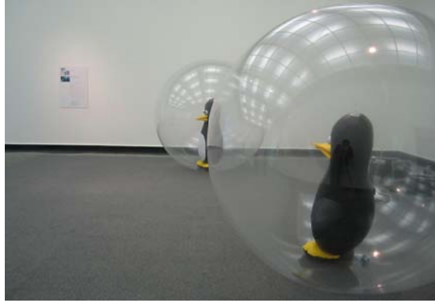
Fig. 5. Goldin+Senneby, Objects of Virtual Desire: Cubey Terra's Penguin Balls . Installation view: Bergen Kunsthall, Bergen, Norway 2005.