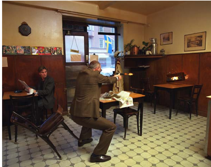
Fig. 1. Olof Glemme, På Kafé , 1993. Courtesy of Olof Glemme.

På Kafé from 1993 by Olof Glemme (b. 1952) is an early example of ICT used as a tool in the making of photography (fig. 1). The photograph depicts a man using a gun shooting at a radio in a café, and it is considered to be the first photograph Glemme has created by using digital image processing technology [5].