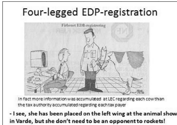
Fig. 3. A cartoon from Jyllandsposten, December 3 1983

About 60 reports were produced by the milk recording system intended for herd owners and The National Committee, reports such as Herd report, Cow report, List of young cattle, Annual herd statement and Herdbook summary.