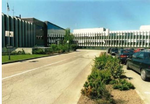
Fig. 1. Danish Agricultural EDP-Center, Bytoften, 8240 Risskov, Denmark

The Advisory department took care of sales, development and service. The staff acted as a link between LEC's users and LEC. The department was divided into four sections, and each section was divided into groups related to different user groups. The Systems department included systems design and programming. The Production department was responsible for running LEC's computers. It received input material from customers, prepared data for the computer, checked and controlled the output, packed and dispatched the output to the customers.