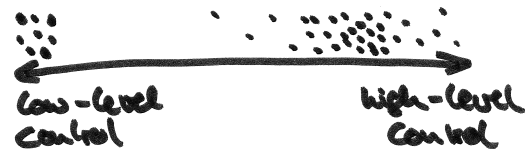
Figure 1: Existing NPAR tools in the interaction spectrum.

low-level control is desired, the technique could also allow artists or illustrators to adjust the result in high detail, down to the individual marks. Some researchers have attempted to support such large-scale to detailed adjustment in the past, for example Deussen/Hiller et al. [DHvOS00, HHD03] with their brush-based adjustment of stippling. Yet, a professional artist would probably prefer to be able to explicitly draw marks like with traditional pens, instead of using brushes that stochastically place new dots somewhere within their scope—even if that is very small.