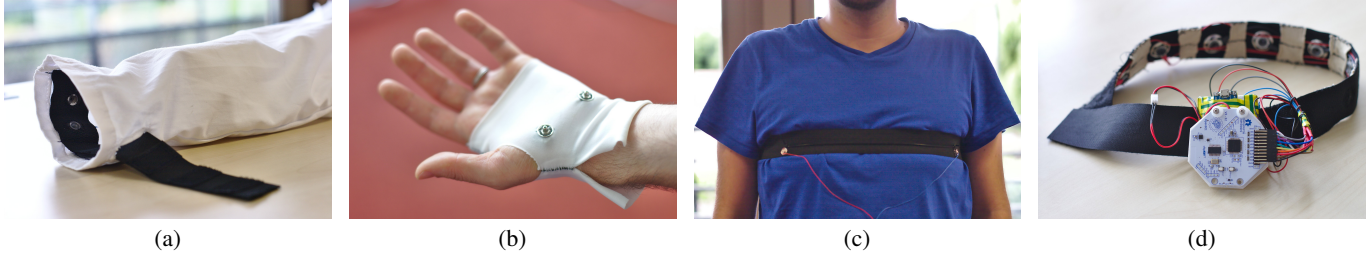
Figure 2: Wearables. a: coat embedding ECG sensors; b: fingerless glove measuring EDA; c: breathing belt; d: EEG headband.

as break rooms or living rooms. Different colleagues or family members could work together onto shaping the world, and then the world would evolve according to their states – monitored using wearable sensors such as smartwatches – e.g. Empatica’s E4 1 . This could lead to interpersonal interactions, both in working together to improve the garden and cultivating empathy between participants.