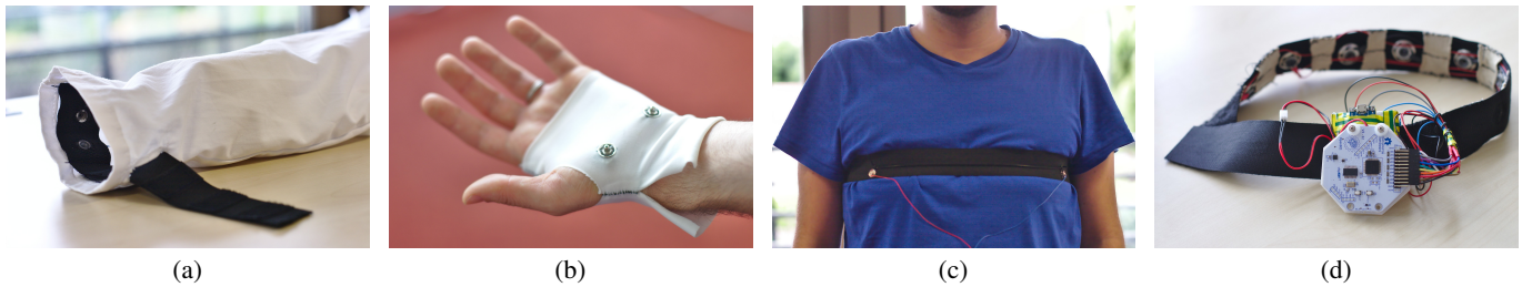
Figure 2: Wearables. a: coat embedding ECG sensors; b: fingerless glove measuring EDA; c: breathing belt; d: EEG headband.

as break rooms or living rooms. Different colleagues or family members could work together onto shaping the world, and then the world would evolve according to their states – monitored using wearable sensors such as smartwatches – e.g. Empatica’s E4 1 . This could lead to interpersonal interactions, both in working together to improve the garden and cultivating empathy between participants.