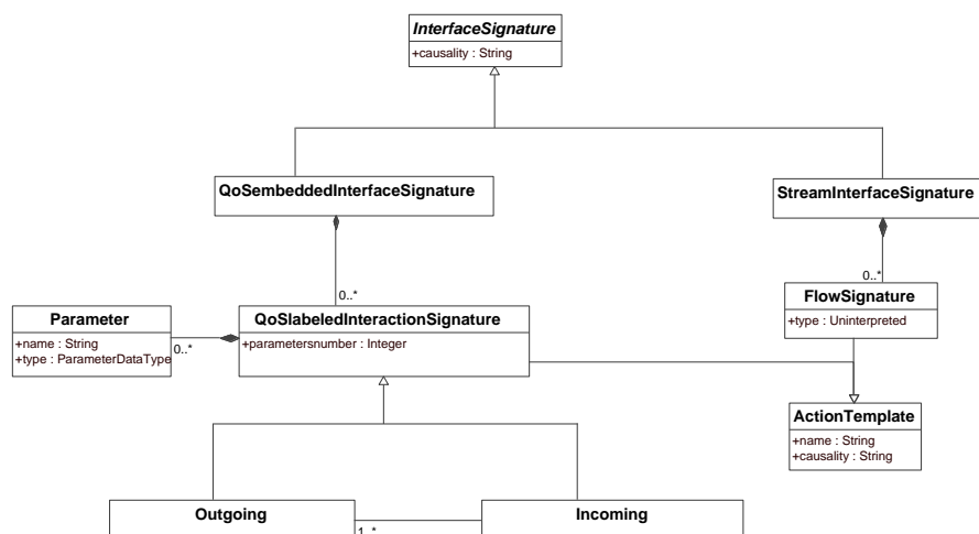
Figure 3. QoS-embedded interface & QoS-labeled interaction signatures metamodel

Before we define outgoing and incoming interactions we have to redefine causalities at both interface and interaction level. Causalities in the computational language are of three kinds corresponding to the types of both interfaces and the interactions they support. That is, "client" and "server" causalities, "initiator" and "responder" as well as "producer" and "consumer", respectively for operational interfaces and operations, signal interfaces and signals and finally, stream interfaces and flows.