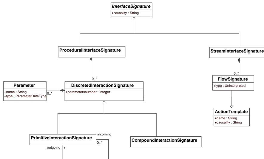
Figure 2. Procedural interface signatures metamodel

In this section we have introduced a precise definition of Action Templates . We have also defined two new concepts. First we have defined Discrete interaction signatures which we have used to define Procedural interface signatures. Based on those new concepts, we have elaborated a new metamodel of interaction and interface signatures. In the following section we use the results of the present section in order to introduce new QoS-aware concepts to the computational viewpoint.