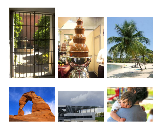
Fig. 2: Some images from SENSE.

fact, in case of strong emotions, one can imagine that the emotion felt for an image could modify the decision for the following image(s). This low-semantic aspect also allow different applications, for example, an application of re ranking images according to their emotional impact or an application of cook recipe image retrieval that eventually contains low semantic images. The short viewing duration is another constraint in the evaluation to reduce the semantic interpretation.