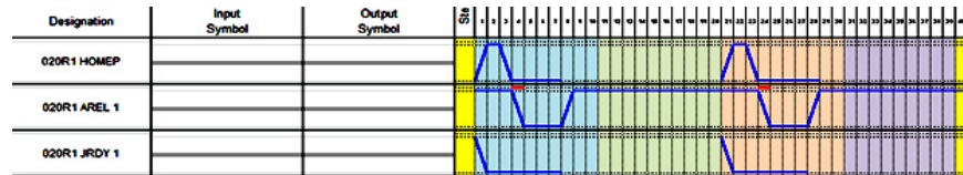
Fig. 3. Excel Tool for applying the ProFlex methodology.