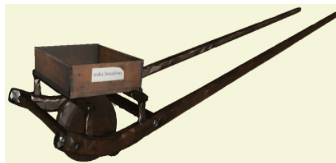
Fig. 3. A final 3D content representation

The plough, which is a virtual museum artefact, is a structural component that consists of the three geometrical components—a box, a wheel and a frame (S5-S7). The SLP2 is applied to the S5-S7—in the resulting PSR, instructions that create new objects in the scene, precede instructions that link these objects by properties (T3). In the example, the resulting PSR (an ActionScript document) includes the Ts in the required order, with the proper TPs specified. The PIR has been created with the Protégé editor. However, a tool for visual semantic modelling can be developed.