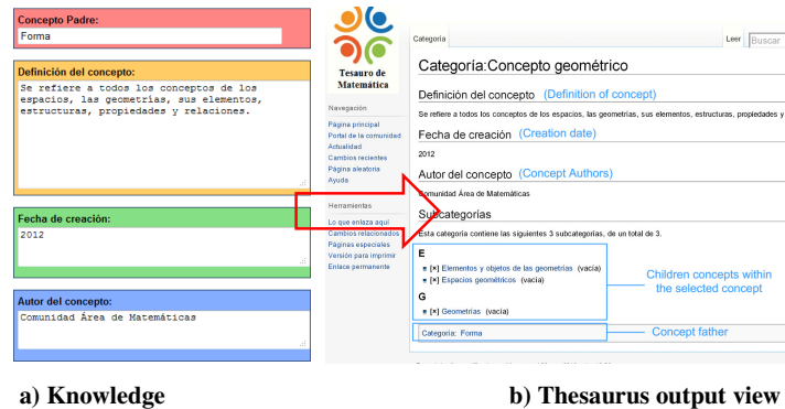
Fig. 3. Knowledge gathering in the wiki insertion form.

System. Whether the contextual information is formal, seed by the keywords and associated meaning or by the ontology, the expertise of the platform users is available for the implemented architecture be able to recommend with some context awareness. This could be reached by associating for instance the levels of expertise of users to the collected by associating the number of times that the user consults a specific topic. Then, by specific inference it is possible for the system to be aware of some context. One professor with a specific profile normally has interests or needs about a particular thing (e.g. VLO).