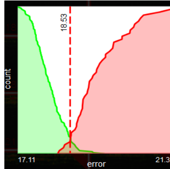
Fig. 2. Cumulative distribution of the reconstruction errors of the precision electromotor dataset. The cumulative distribution of good samples is marked with green, while that of bad samples with red, which is flipped vertically to help examine the overlap between the two distributions. The less overlapped they are, the better performance Tilear has. No overlap means the detector can always make the right decision. The threshold selected by Tilear for decision making is shown as a red dashed line along with its actual value.

For the precision electromotor, vibration signals were acquired from 36 samples including 21 good samples and 15 defective samples with missing gears on different stages. Cepstrograms of these signals were used as the input for Tilear . The distribution of the reconstruction errors is shown in Figure 2.