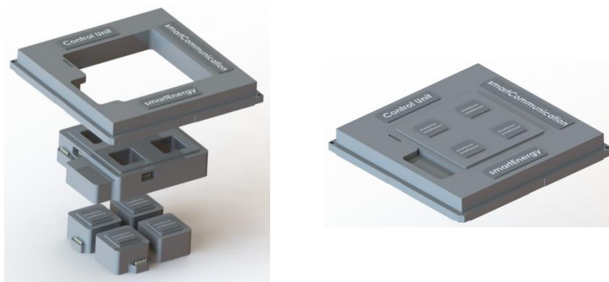
Fig. 2. Mechanical design of the workpiece carrier system

ical interfaces refer to the standard DIN 32561. This standard describes dimensions and tolerances of a tray in the field of production equipment for microsystems. The mandatory elements of the electronic platform, control unit, communication as well as energy supply and transfer, are placed into the frame. Thus an encapsulation of the electronic components in rough environments like ultra-precision machining is ensured. The aperture within that frame architecture can now be individually designed with modules, considering the mechanical and electronic interfaces to the workpiece carrier and is matched to the size of 100 x 100 mm 2 , which most microtechnical devices fit into, pursuant to [8]. For the integration of multiple modules distribution modules can be applied.