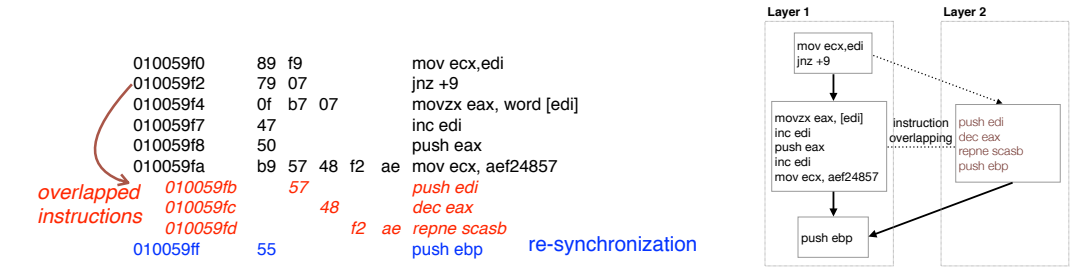
Figure 9: Overlapping: UPX case

terested in reconstructing the assembly code of the malware. The assembly code reconstruction of a packed malware is a different issue than the one studied in this work. Indeed we may for example develop a packer in which the malware functionalities and the protection functionalities are fully intertwined. In this case, malware functionality identification and reconstruction is a research subject per se. For example, the work of Yadegari et al. [34] developed a de-obfuscation method to extract a simplified code. For this, they combined a dynamic analysis with concolic executions in order to collect several traces, which are simplified in order to reconstruct a control flow graph.