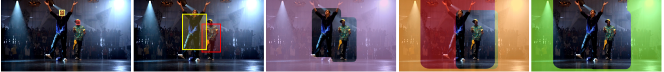
(a) Head constraint. (b) Body constraint. (c) Background constraint. (d) Non-person. (e) Must-be background.

Figure 3: Constraints (see Section 3.4) used in our model for multi-person segmentation. In this setup we are provided head detections, from which we derive body boxes. We require 75% of pixels inside head detections (a) and 50% of pixels inside body boxes (b) to belong to the instance. Part (c) illustrates the background constraint (96% of this surface should be background); non-person constraints which enforce superpixels far from the person to be assigned to the corresponding label (d); and the superpixels which can only be background (e).