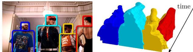
Figure 1: Results of our method applied to multi-person segmentation in a sample video from our database. Given an input video together with the tracks of object bounding boxes (left), our method finds pixel-wise segmentation for each object instance across video frames (right).

Instance-level object segmentation in video is an interesting and understudied problem at the intersection of semantic and motion-based video segmentation. Solutions to this problem can benefit from class-specific object models and motion cues. Segmentation of static and/or partially occluded objects of the same class, however, pose additional challenges, difficult to solve with existing methods of motion-based and semantic segmentation. Meanwhile, successful solutions to instance-level video segmentation can