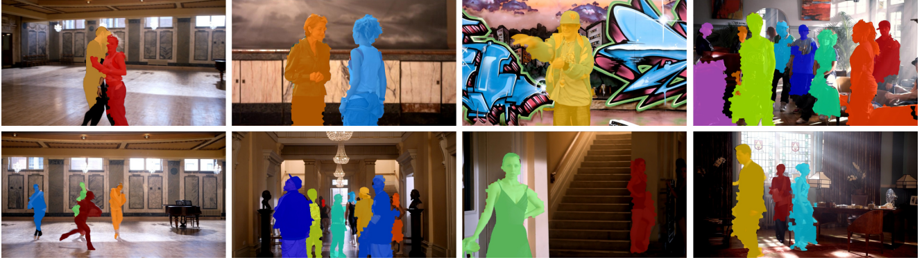
Figure 4: Qualitative results of our method. Note that most of the visually unpleasant artifacts are due to the use of superpixels.