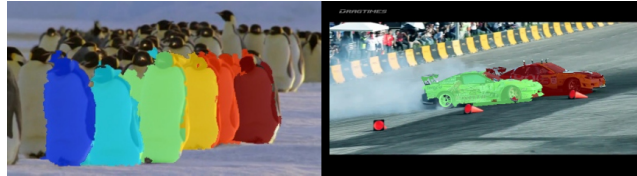
Figure 6: Results of our method applied to two multi-instance videos from SegTrack v2 [30].

The CRF as RNN method is the best performing baseline. It produces a clean figure-ground segmentation for a given object class. When people are separated in the image, our relabelling procedure inherently produces good instance-level segmentation results. However, when the person instances are close by or overlap, our method often outperforms the baseline. Our method, which uses only generic features (color, motion, SIFT) and ad-hoc constraints, still performs as well as this strong baseline. It successfully segments each object instance with only coarse localization cues (encoded in the constraints) and without training a pixel-level appearance model for the segmentation as does the baseline. In addition, when including semantic features in the discriminative term (extracted from the baseline), the performance of our method exceeds the one of the baseline.