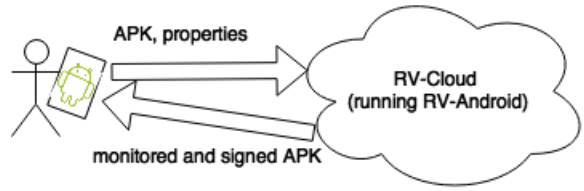
Fig. 2: RV-Android On-Device Architecture