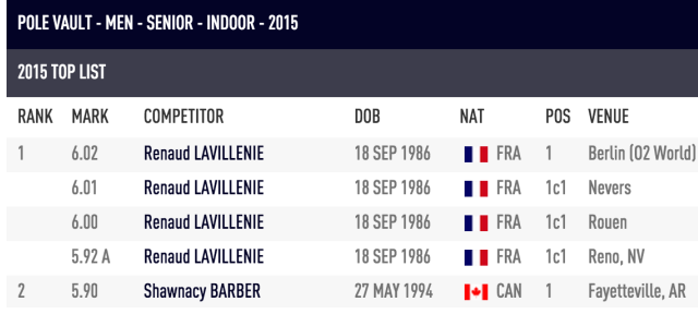
Figure 2. IAAF: A Web page as a data source ( http://www.iaaf.org/records/toplists/pole-vault/indoor/men/senior/-2015 ).