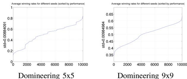
Fig. 1: Impact of the seed on the success rate. For the n^{th} value, we consider the n^{th} worst seed for Black and the n^{th} seed for White, and display their average scores against all opponent seeds. The label on the y-axis shows the standard deviation of these averages; we see that there are good seeds (far above the 50 % success rate, by approx. 12x the standard deviation).

We now summarize the two approaches, in Algorithm 1.