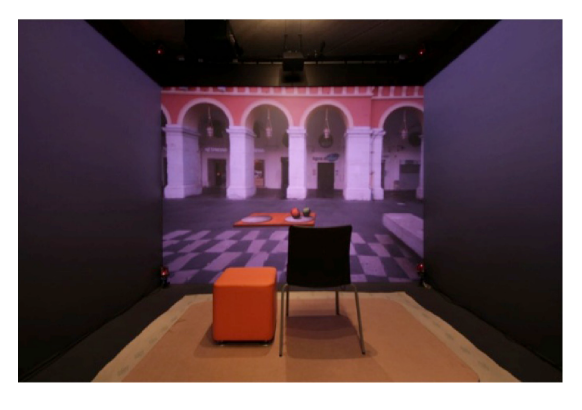
Figure 2 Hardware setup used for the experiments.