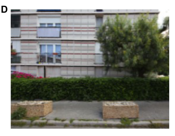
Figure I Four visual conditions used during the experiment and presented to participants in the following order. Notes: (A) Baseline condition (gray, a medium gray blank screen). In accordance with the classical use of pictures in reminiscence therapy, participants were presented with (B) a photograph of a well-known location in the participant's home city in Nice (FamPhoto). The two conditions of virtual reality are presented in a random order; ie, (C) a familiar image-based virtual environment (FamIBVE) consisting of an image-based representation of a known landmark in the center of the city of experimentation (Nice), and (D) an unknown image-based virtual environment (UnknoIBVE) captured in a public housing neighborhood, containing unrecognizable building fronts. Abbreviation: IBVE, image-based virtual environment.