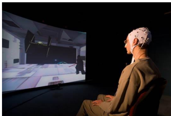
Figure 1: The “Use-the-force” application. The user had to lift up a virtual spaceship using foot motor imagery.

In Lotte et al (2008), the usability of a BCI videogame in 3D (Figure 1) was assessed using questionnaires that measured the feeling of control, the fatigue, comfort and frustration induced by the BCI game, both for control commands based on real and imagined foot movements.