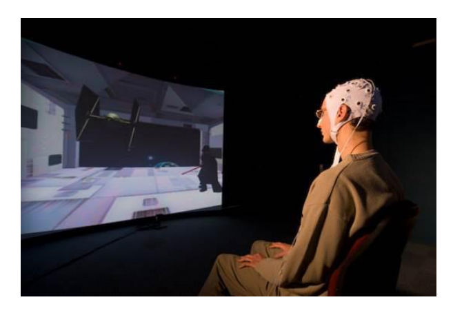
Figure 1: The "Use-the-force" application. The user had to lift up a virtual spaceship using foot motor imagery.

In Lotte et al (2008), the usability of a BCI videogame in 3D (Figure 1) was assessed using questionnaires that measured the feeling of control, the fatigue, comfort and frustration induced by the BCI game, both for control commands based on real and imagined foot movements.