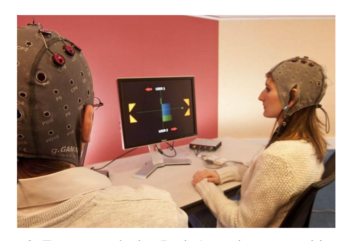
Figure 2: Two users playing BrainArena in a competitive trial.

In the entertainment area, some multi-brain videogames begin to appear (Figure 2): each player uses a BCI ( e.g. , Bonnet et al., 2013).