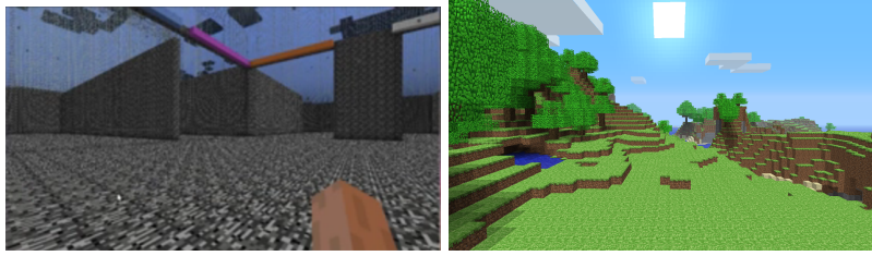
Fig. 1 Two examples of digital experimental environments for systemic neuroscience. Left: A minimal environment corresponding to a standard maze reinforcement learning task (source: one of our virtual enaction built). Right: A complex environment in which survival capabilities are to be checked (source: landscape encountered when playing with the standard game).

mands, while their closed loop execution is delegated to the peripheral motor system [Uithol et al., 2012], we may accept to only simulate gesture and displacement at a rather symbolic level such as “stand-up” or “turn 90° rightward”. This indeed cancels the possibility to study sharp phenomena of motor interactions with the environment but allows us to concentrate on high-level control such as action selection mechanism and motor planning.