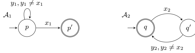
Fig. 1. Two PAs \mathcal{A}_1 and \mathcal{A}_2 where the variable y_1 is refreshed in the state p , and the variables x_2, y_2 are refreshed in the state q .

Example 1. Let \mathcal{A}_1 and \mathcal{A}_2 be the PAs depicted above in Figure 1 where the variable y_1 is refreshed in the state p , and the variables x_2, y_2 are refreshed in the state q . That is, \mathcal{A}_1 = \langle \Sigma, \{x_1, y_1\}, \{p, p'\}, \{p\}, \delta_1, \{p'\}, \kappa_1 \rangle with