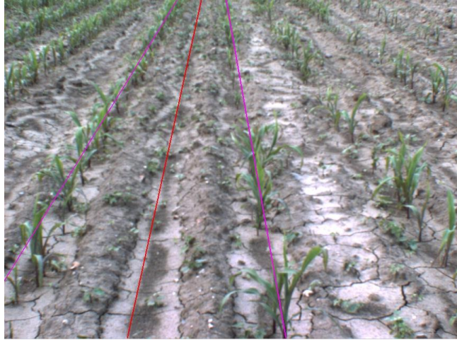
(a) Navigation path shown in original image