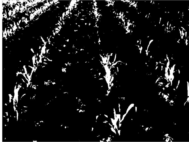
(a) Binary image after thresholding