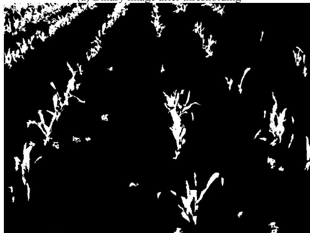
(b) Binary image after weed noise filtration.