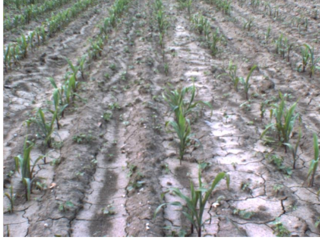
(a) Original color Image of corn field