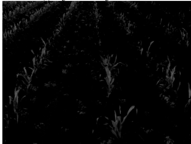
(b) Image after grey level transformation