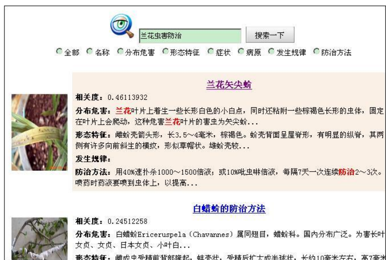
Fig. 2. Query interface of prescription search engine

of the developed search engine lists excerpts of every prescription fields and a photo of that disease (if any exist). When the user clicks on the titles of retrieved results, the details of the corresponding agricultural disease prescription will be displayed in a pop-up window as show in Figure 3. All the information about the selected agricultural disease is organized by the prescription fields. A navigation menu on the top-right side of the view is designed to help user browse details of the prescription document. We can roughly say that, through using our system, it would be much easier for farmers to locate their needed information in agricultural disease prescriptions.