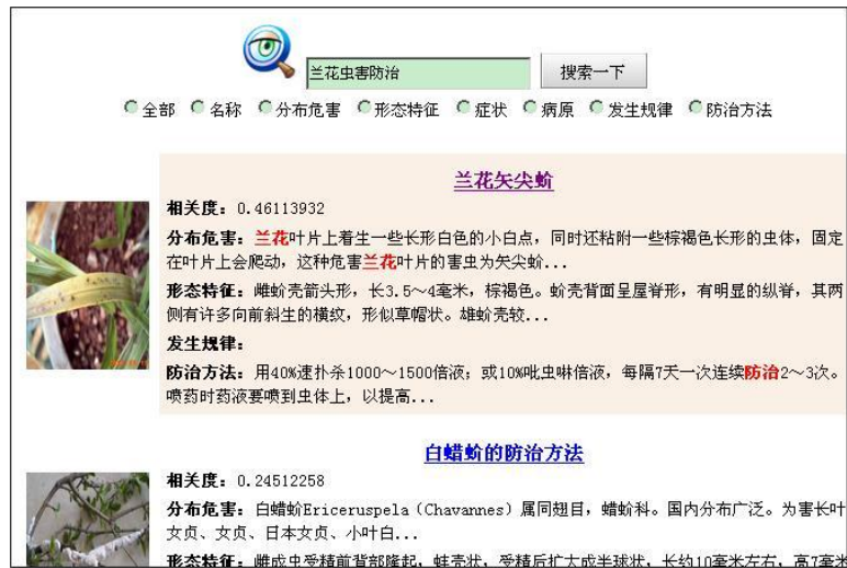
Fig. 2. Query interface of prescription search engine

of the developed search engine lists excerpts of every prescription fields and a photo of that disease (if any exist). When the user clicks on the titles of retrieved results, the details of the corresponding agricultural disease prescription will be displayed in a pop-up window as show in Figure 3. All the information about the selected agricultural disease is organized by the prescription fields. A navigation menu on the top-right side of the view is designed to help user browse details of the prescription document. We can roughly say that, through using our system, it would be much easier for farmers to locate their needed information in agricultural disease prescriptions.