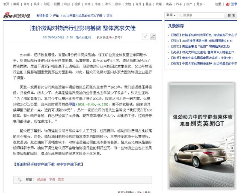
Fig. 3 the Original Page

http://finance.sina.com.cn/review/jcgc/20130606/182015723399.shtml .