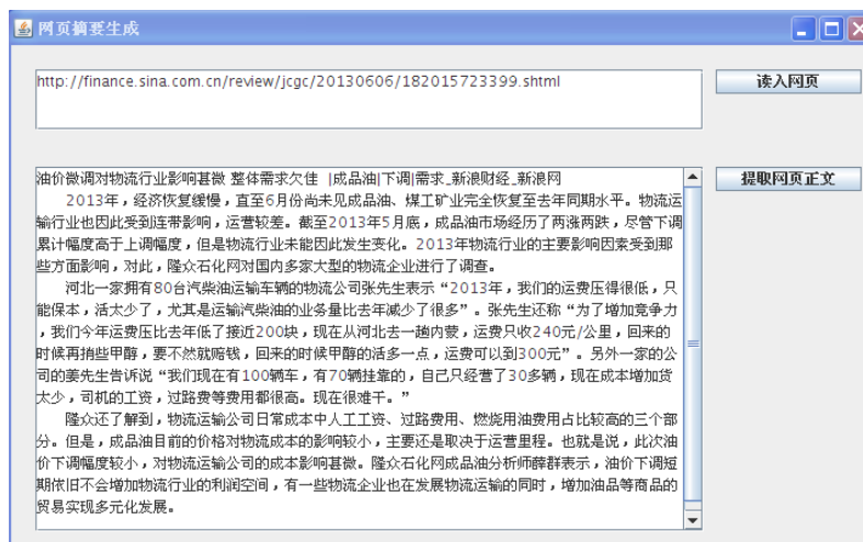
Fig. 4 Extraction Results

We divide the obtained theme information into three levels: (1) Excellent: the obtained web text is consistent with the text manually labeled. (2) Good: compared to the text manually labeled, there is only 1-2 sentences lost, or the text contains 1-2 noise blocks. (3) Poor: The text contains many mistakes. Specific test results are shown in table 2 [16] .