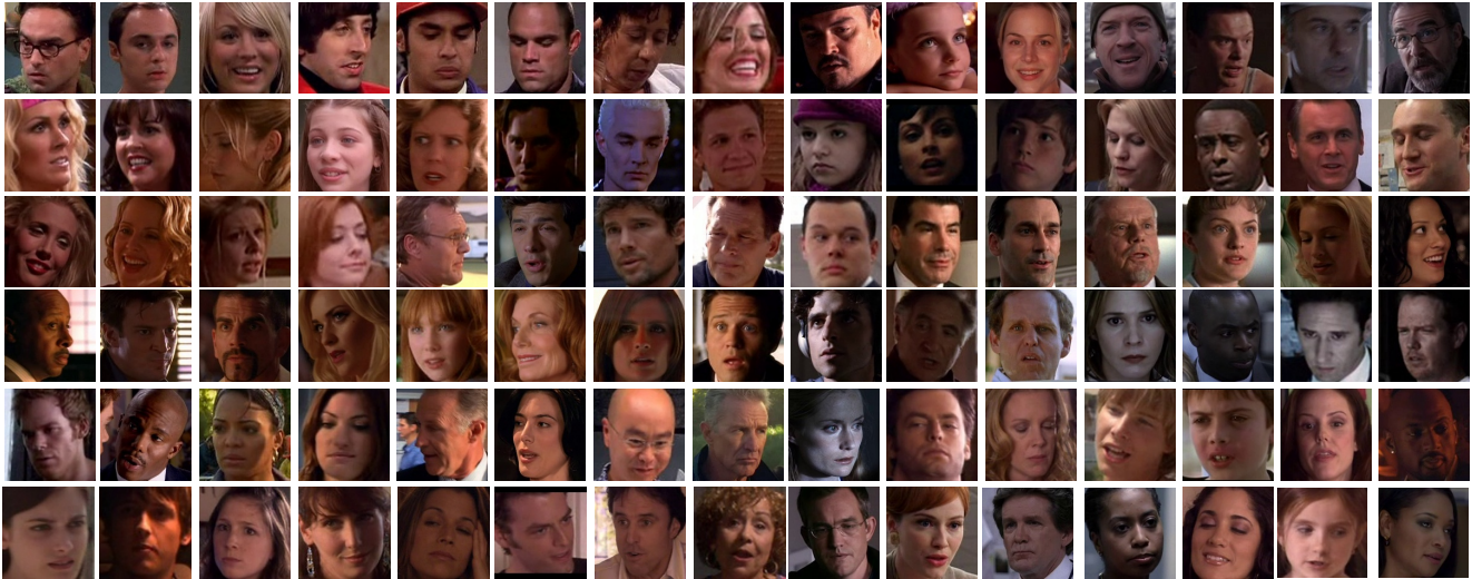
Figure 2. Example faces of the 94 subjects from the proposed TV Series Face Tubes (TSFT) dataset. The dataset has diverse set of subjects (age, gender, race, sex) who appear in different lighting conditions (home, office, bar, field, inside car, at day, at night) and have varied pose, expressions and motions.