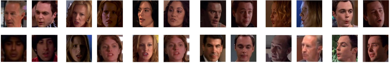
Figure 4. Typical false positive face pairs, selected from test face tube pairs, with the proposed latent metric learning algorithm.