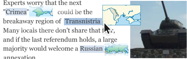
Figure 2: Small maps embedded as word-scale visualizations provide details-on-demand for locations in a news story. Interacting with the entity or map grows the visualization to show more detail. The text stays as it is and the visualization is overlaid over the text.

Experts worry that the next "Crimea" could be the breakaway region of Transnistria. Many locals there don't share that view, and if the last referendum holds, a large majority would welcome a Russian annexation.