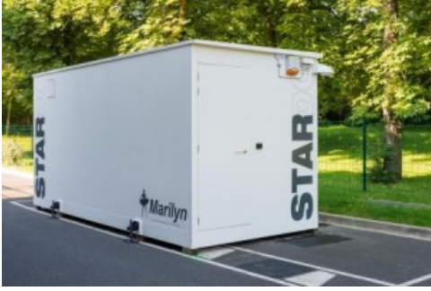
Fig. 1. The public presentation of the StarDC container occurred on September 18th 2014 during Nu@ge inauguration in CELESTE headquarters, Marne-la-vallee, France.

prototype has been realized by using a customized version of OpenStack over 4 different geographic locations in France.