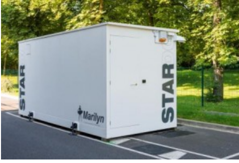
Fig. 1. The public presentation of the StarDC container occurred on September 18th 2014 during Nu@ge inauguration in CELESTE headquarters, Marne-la-vallee, France.

prototype has been realized by using a customized version of OpenStack over 4 different geographic locations in France.