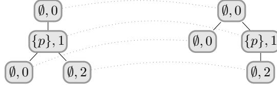
■ Figure 5 Two data trees with \Sigma \stackrel{\text{def}}{=} \{\emptyset, \{p\}\} and \mathbb{D} \stackrel{\text{def}}{=} \mathbb{N} . The bisimulation relation is depicted by dotted grey lines. The left tree satisfies formula (4) at its root, but the right tree does not.

where p is in A . The semantics \llbracket \pi \rrbracket_{\mathbf{t}} of a path formula \pi over a data tree \mathbf{t} is a binary relation over its domain: