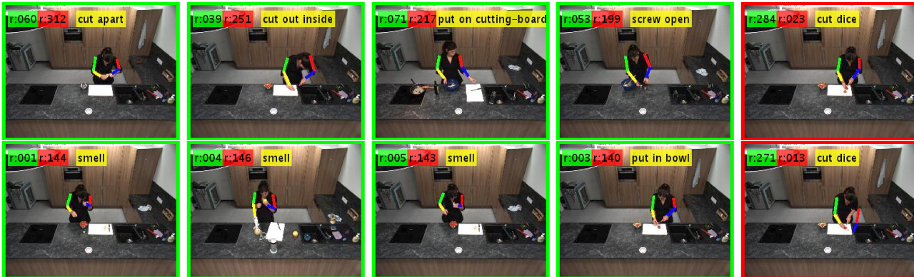
Figure 5: Results on MPII Cooking-Pose [8] (split 1). Examples on the left (green) show the 8 best ranking improvements (over all classes) obtained by using P-CNN (rank in green) instead of IDT-FV (rank in red). Examples on the right (red) illustrate video samples with the largest decrease in the ranking. Each video sample is represented by its middle frame.