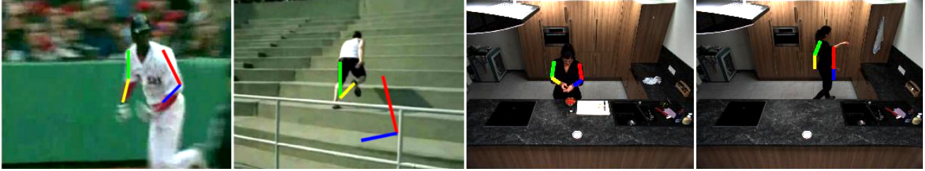
Figure 2: Illustration of human pose estimation used in our experiments [8]. Successful examples and failure cases on JHMDB (left two images) and on MPII Cooking Activities (right two images). Only left and right arms are displayed for clarity.

Dynamic features are obtained from trajectories of body joints. HLPF combines temporal differences of some of the static features, i.e., differences in distances between pairs of joints, differences in orientations of lines connecting joint pairs and differences in inner angles. Furthermore, translations of joint positions ( dx and dy ) and their orientations ( \arctan(\frac{dy}{dx}) ) are added.