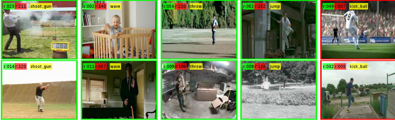
Figure 4: Results on JHMDB-GT (split 1). Each column corresponds to an action class. Video frames on the left (green) illustrate two test samples per action with the largest improvement in ranking when using P-CNN (rank in green) and IDT-FV (rank in red). Examples on the right (red) illustrate samples with the largest decreases in the ranking. Actions with large differences in performance are selected according to Figure 3. Each video sample is represented by its middle frame.