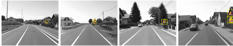
Fig. 3. Localization results: first two images depict the successful operation of our approach. The positively scored patches corresponding to different visual words are shown in different colors. The second two images show examples of false alarms.

patch locations is much larger. An interesting area of application might be a weakly-supervised multi-class object localization, e.g. multi-class traffic signs. To the best of our knowledge, prominent commercial real-time systems detect a single type of sign at a time [28] (e.g. speed limits). As for the choice of the spatial models, both SFV and SH take approximately 0.2 s per image. In comparison to SH, the SFV includes the computation of the gradient w.r.t. spatial GMM. However, the SFVs can be precomputed due to (i) the known size of the local neighbourhood, and (ii) fixed GMM shared across all component pairs. Thus, by using SFV we benefit both from accuracy and speed.