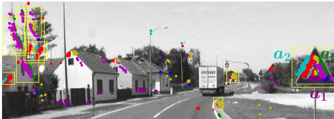
Fig. 1. The appearance model identifies distinctive patches (enclosed in yellow rectangles) assigned to selected visual words (shown in colors). The spatial model learns consistent spatial configurations between pairs of selected visual words, e.g. between a_1 (purple) and a_2 (cyan), a_1 (purple) and a_3 (green) and so on.