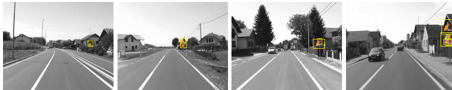
Fig. 3. Localization results: first two images depict the successful operation of our approach. The positively scored patches corresponding to different visual words are shown in different colors. The second two images show examples of false alarms.

patch locations is much larger. An interesting area of application might be a weakly-supervised multi-class object localization, e.g. multi-class traffic signs. To the best of our knowledge, prominent commercial real-time systems detect a single type of sign at a time [28] (e.g. speed limits). As for the choice of the spatial models, both SFV and SH take approximately 0.2 s per image. In comparison to SH, the SFV includes the computation of the gradient w.r.t. spatial GMM. However, the SFVs can be precomputed due to (i) the known size of the local neighbourhood, and (ii) fixed GMM shared across all component pairs. Thus, by using SFV we benefit both from accuracy and speed.