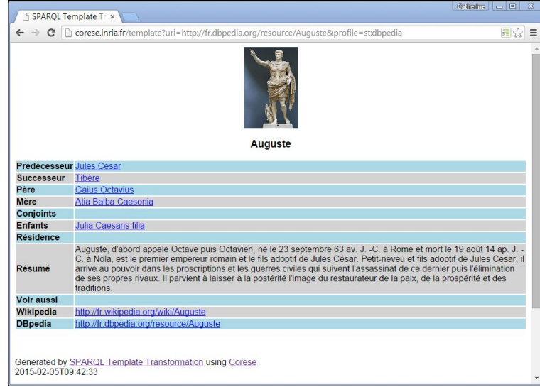
Fig. 2. DBpedia Navigator

The DBpedia SPARQL endpoint is accessed through a SERVICE clause in a predefined CONSTRUCT query to retrieve relevant data according to the types of resources that the application is interested in: our navigator focuses on historical people and places. Then the st:navlab transformation is applied to the resulting RDF graph. It generates a presentation in HTML format of the retrieved data, adapted to the type of targeted resources — people and places. In particular, the transformation localizes places on a map.