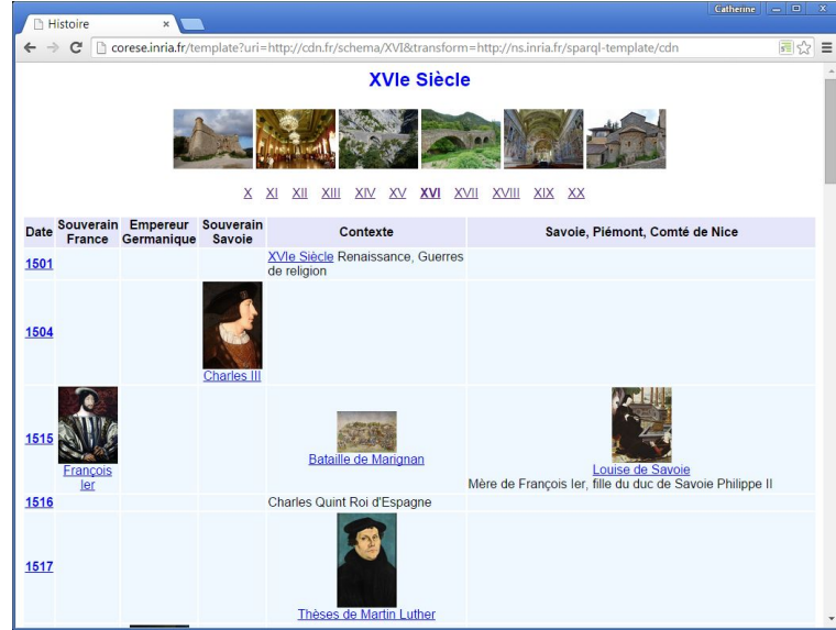
Fig. 3. History Navigator

the former st:navlab transformation. Figure 3 is a screenshot of an HTML page generated by the server.