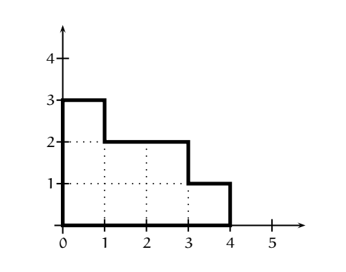
Fig. 1: Young diagram (4, 3, 1) drawn in the French convention