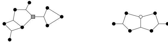
Fig. 2: A hypergraph with an articulation vertex (left) and one without (right).

Lemma 1 is not very deep but it is the first step towards a stronger result that serves as the vital tool for our analysis. A vertex p of a connected hypergraph H is an articulation vertex if H can be written as a union H = A \cup B of two nontrivial hypergraphs A and B with V(A) \cap V(B) = \{p\} . (The left hypergraph in Figure 2 has exactly one articulation vertex, the square one. The central vertex in the hypergraph on the right is not an articulation.) We shall see that also in the case of articulations, we can describe how the value of the union H is related to that of A and B .