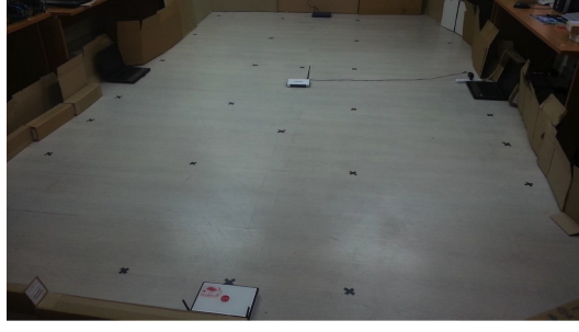
Fig. 2. Real scenario.

We placed the two hotspots in the points West and East of the area, the target in the centre of the area and at North and South we put the other routers. The reference scenario is represented by an area of 15m^2 ( 3 \times 5m ) as shown in Figure 2. The received power value has been obtained both from the anchor nodes (landmarks) and the target through the command Iwlist , that is available in the Linux platform as part of the wireless-tools library. Through this package, it is possible to have a set of commands to control the wireless devices based on the standard 802.11. The Iwlist command is used in combination with some parameters to better specify the data requested by a user. It details, for every detected network, a set of data related to the ESSID of the network, the quality of the signal, the transmission channel frequency, and the Received Signal Strength Indication (RSSI).