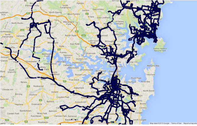
Fig. 1: Geo-distribution of the collected SSIDs in Sydney

studied the names of user devices that are sending mDNS in a WiFi network and found that 59% of the device names contained real names and 17.6% contained both first name and last name. Ferreira et al. [15] investigated the effect that trust and context have on users when choosing wireless networks. For example, it was shown that users tend to connect to the networks known to them or have connected in the past, despite not completely trusting them.