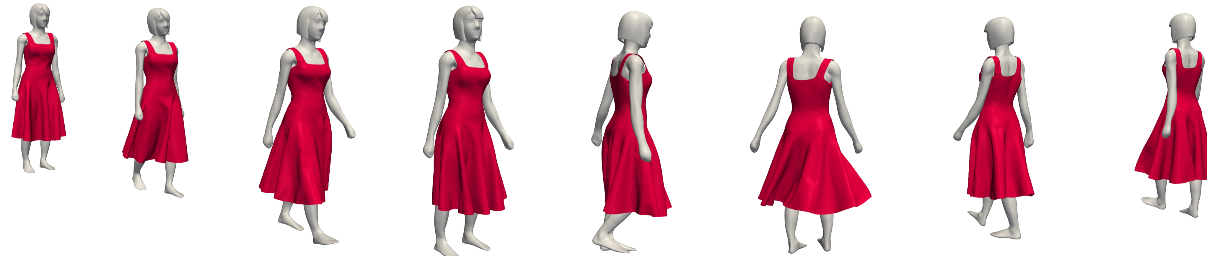
Cloth design and body animation by Laurence Boissieux

Cloth dynamics plays an important role in the visual appearance of moving characters. Properly accounting for frictional contact is of utmost importance to avoid cloth-body penetration and to capture folding behavior due to dry friction. We present here the first method able to account for contact with exact Coulomb friction between a cloth and the underlying character. Our key contribution is to formulate and solve the frictional contact problem merely on velocity variables, by leveraging some tools of convex analysis. Our method is both fast and robust, allowing us to simulate full-size garments with more realistic body-cloth interactions compared to former methods, while maintaining similar computational timings.