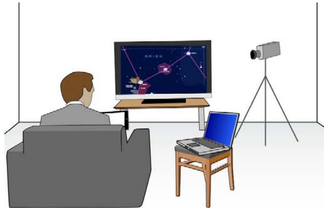
Figure 3. Participants viewed CompanionMap on a tablet they were holding while watching the television programme on a large screen. The laptop to one side displayed the probe questions after each episode and logged participants' responses.

Experiment 1 used a one-way repeated measures design comparing Condition (watching the TV programme with and without CompanionMap). Each participant viewed both programme episodes, one with CompanionMap; the order of the episodes and the use of CompanionMap was counter-balanced in a latin square of four groups to avoid learning effects. The probe questions were administered both before and after watching the programme episodes. Experiment 2 also used a one-way repeated measures design comparing the use of the interactive version of CompanionMap with the base version. The experimental design was identical to the first experiment except for Condition (non-interactive and interactive CompanionMap). All dependent variables were identical.