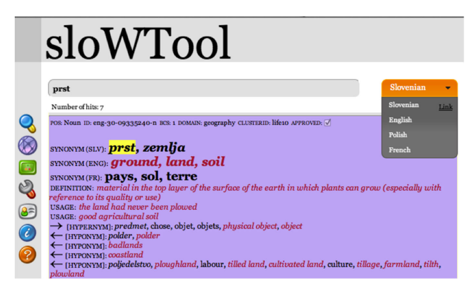
Fig. 4 An example of a Slovene wordnet synset { prst, zemlja } with the corresponding English (in red ) and French (in black ) synonyms, an English definition and usage examples, and semantic relations. (Color figure online)

network which they can also compare to English and French since wordnets for these languages are cross-aligned via the Princeton WordNet synset IDs and are available on the sloWTool as well (Fig. 4).