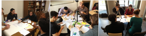
Figure 1: The three participatory design sessions held.

three different user groups (Fig. 1): WWI historians, librarians and medievalists. We expected these to have different interests, practices and goals of research. The aim of these sessions was to understand how different user groups would want to search, browse, and visualize (if at all) information from archival research. In total we had 49 participants (14 in the first, 15 in the second and 20 in the third).