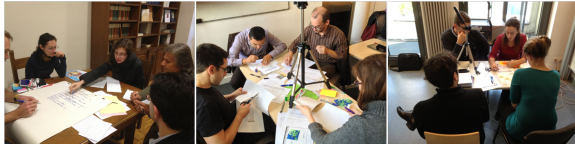
Figure 1: The three participatory design sessions held.

three different user groups (Fig. 1): WWI historians, librarians and medievalists. We expected these to have different interests, practices and goals of research. The aim of these sessions was to understand how different user groups would want to search, browse, and visualize (if at all) information from archival research. In total we had 49 participants (14 in the first, 15 in the second and 20 in the third).