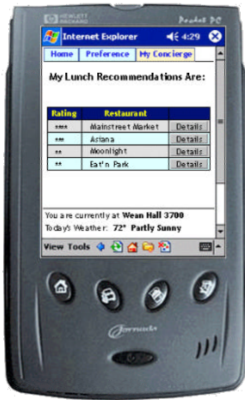
Figure 2: This Restaurant Concierge is an example of a myCampus agent.

Services, Semantic Web annotations, public ontologies and other public resources. On CMU's campus, where we have deployed myCampus , this includes access to a variety of services such as 23 restaurant web services or a public weather forecasting web service. In the following sections, we focus on the use of web services in our system. Additional details on myCampus and some of the agents we have deployed can be found in [4, 5, 9].