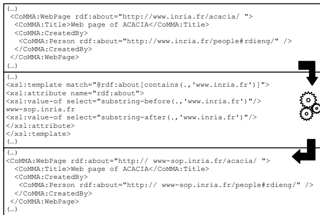
Figure 4. XSLT agent propagating the update of a URI

As an example, let us consider the case where the update is due to the change of the URI of a resource. Figure 4 presents three frames: an example of annotation to be corrected; the XSLT core for correction; the annotation after correction. This fairly simple case illustrates the use of a specialized type of reactive agents, tailored by an information agent to propagate a task over the whole memory. A population of such XSLT agents can be generated automatically by an intelligent agent or through interface manipulation and generic libraries of templates.