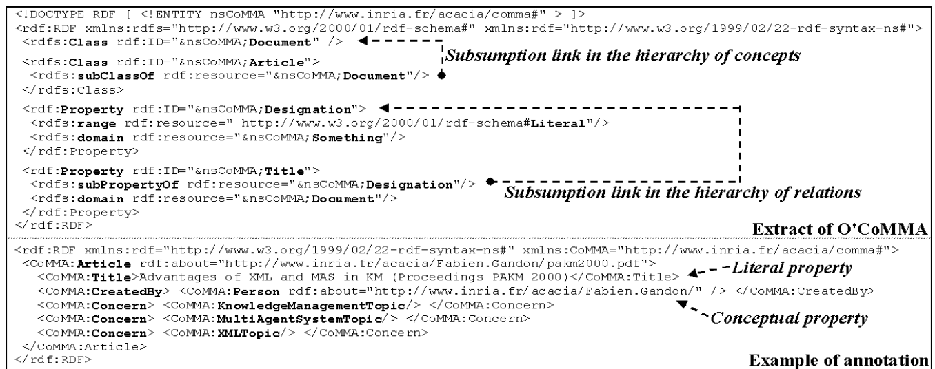
Figure 1. RDF(S) Sample

Likewise, the users' profile captures all aspects of the user that were identified as relevant for the system behavior. It contains administrative information and preferences that go from interface customization to topic interests. It positions the user in the organization: role, location and potential acquaintance network. In addition to explicitly stated information, the system derives information from past usage by collecting the history of visited documents and possible feedback from the user. From this, agents learn some of the user's habits and preferences [15]. These learnt criterions are used for interfaces or information push.